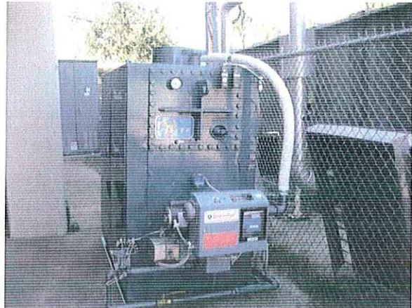
Sherwood – Boiler on Site