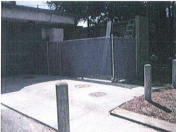
Nottingham – Change Order: Fence at Grease Trap