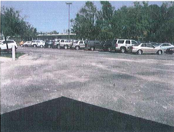
Sherwood – Future Work: Parking Lot Repairs