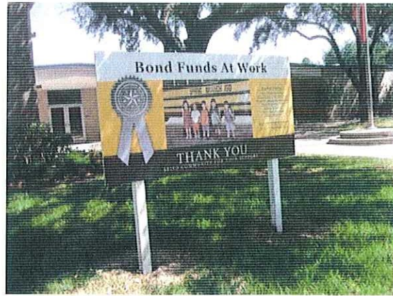
Nottingham – Bond Funds at Work Sign